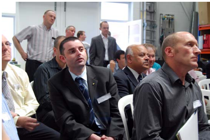
Delegates watch a demonstration of Fr3Oil at BEL's recent launch event