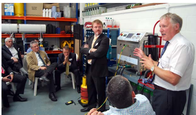
The Fri3Oil system being demonstrated to an audience of 70 leading industry figures at Business Edge's open day and technical conference in July